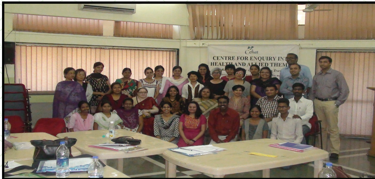
Participants of the Training

3 day workshop was aimed at enabling health professionals to understand the concept of a one stop crisis centre and its relevance in a hospital setting. Specific protocols for responding to domestic violence and sexual assault were presented to the participants and they were asked to develop ways in which these protocols can be implemented at the level of the health system. The participants visited Bombay based Dilaasa, a hospital based crisis centre. Here, they interacted with health professionals and engaged with them to learn from their experience of setting up such services in the given infrastructure of the health setting. This training was attended by various government officials working with the health system as well as non governmental agencies from various states like West Bengal, Haryana, and Maharashtra. The participants ranged from health care providers to child rights activists, social workers and counsellors.