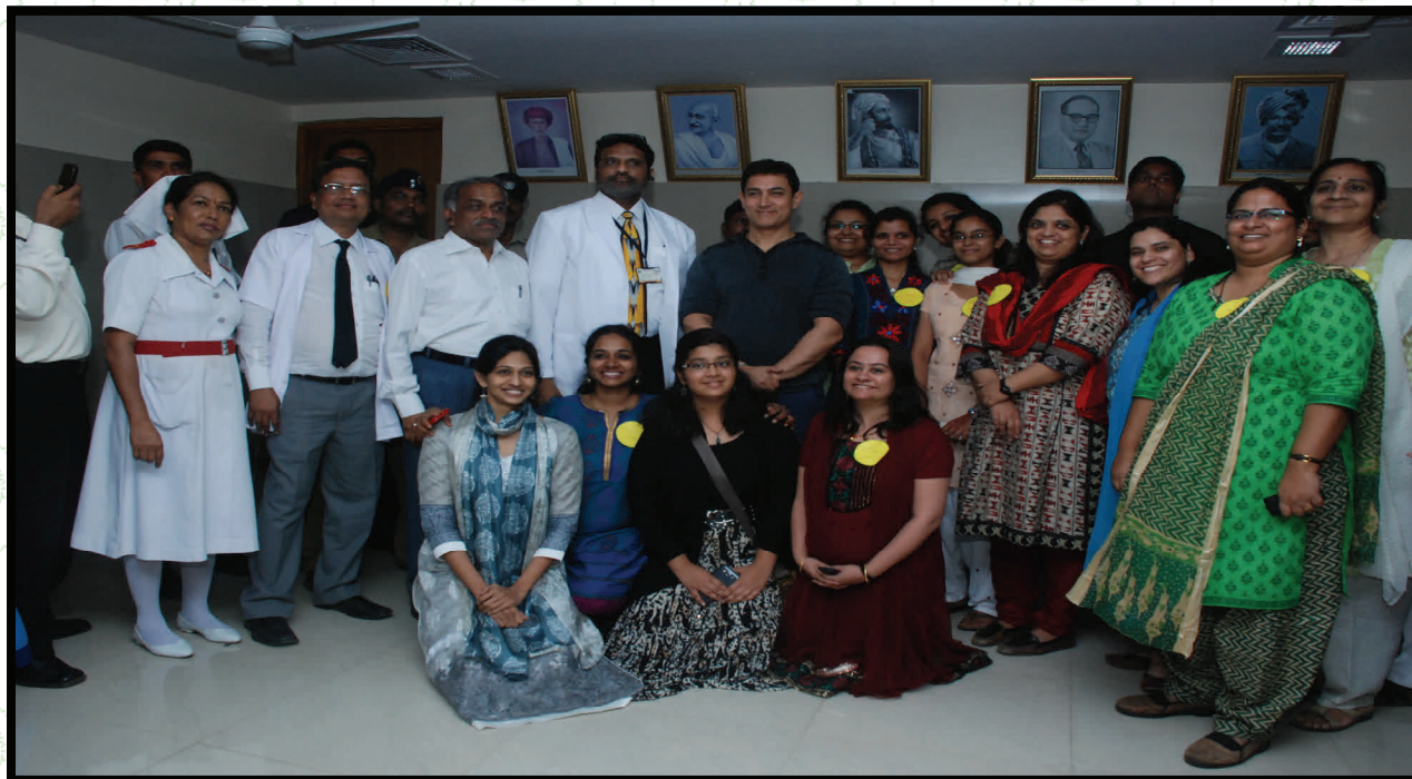
Amir Khan With CEHAT Team

It is 4:30 p.m. on April 3, 2014. Aamir Khan visits the R. N. Cooper Hospital in Mumbai to felicitate teams that have implemented a gender-sensitive and scientific protocol for the medical treatment and examination of survivors of sexual assault. This protocol has been developed by Mumbai-based NGO Centre for Enquiry into Health and Allied Themes (CEHAT) in consultation with the Municipal Corporation of Greater Mumbai (MCGM). It has been implemented in three municipality hospitals so far. Click here for More details